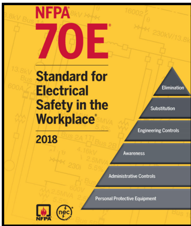
NFPA 70E 2018 Standard for Electrical Safety in the Workplace

The label states that the arc flash boundary is 86 inches. What does this mean? At 86 inches or 7'-2" from the energized bus bar if an arc flash occurs according to the calculated value you will receive in heat 1.2 cal/cm 2 which is considered severe sunburn.