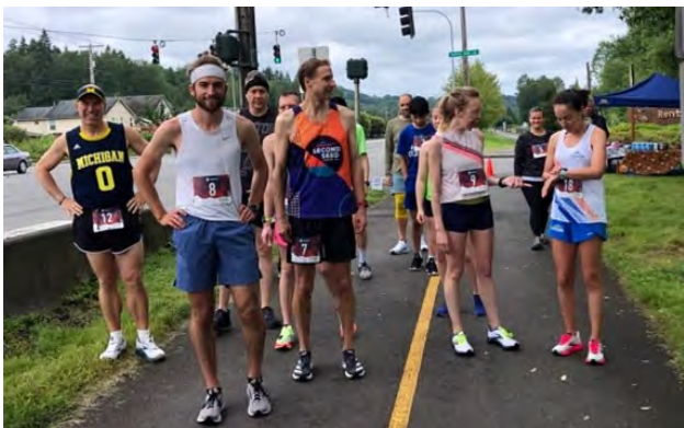
Figure 3 Start of the Red Hawk 6k

10k Bellevue Mercer Slough Nature Park on Saturday November 19, 2022. Burn some calories before the Thanksgiving Break!