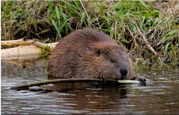
Figure 2 In training for the Beaver Lake Triathlon

We have an exciting summer fitness plan just for you: Join us for the Beaver Lake Triathlon on Sunday August 28, 2022, at 8 am for a ¼ swim in Beaver Lake, 13.1-mile lollipop loop around Duthie Hill followed by a 4.3-mile jaunt around Beaver Lake. Sign up today at BeaverLakeTriathlon.com