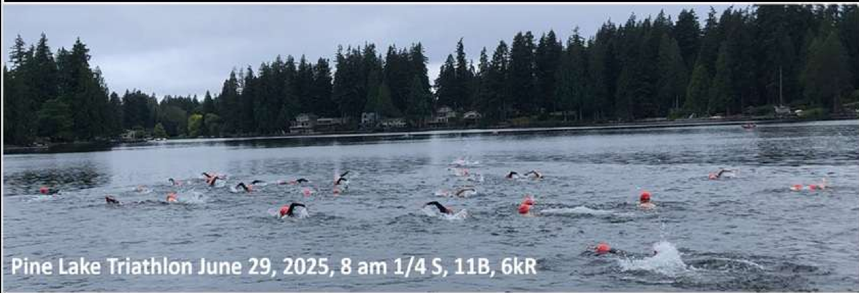
Pine Lake Triathlon June 29, 2025, 8 am 1/4 S, 11B, 6kR