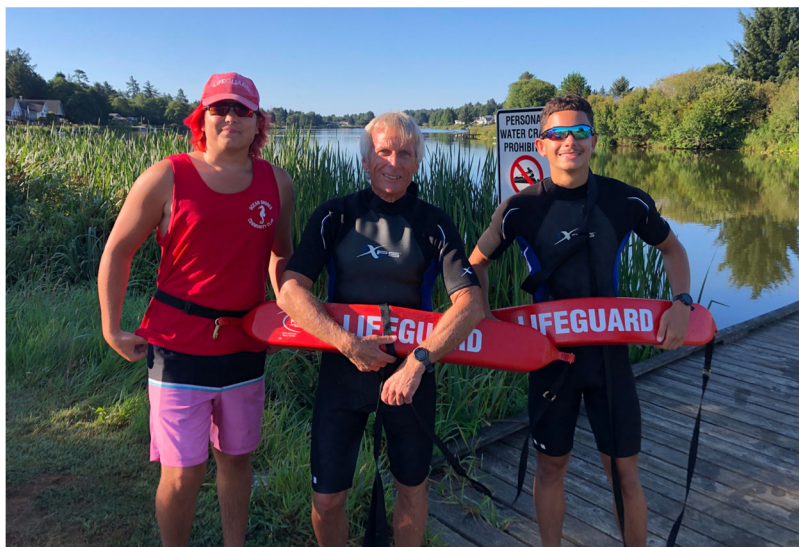
Lifeguards at Ocean Shores