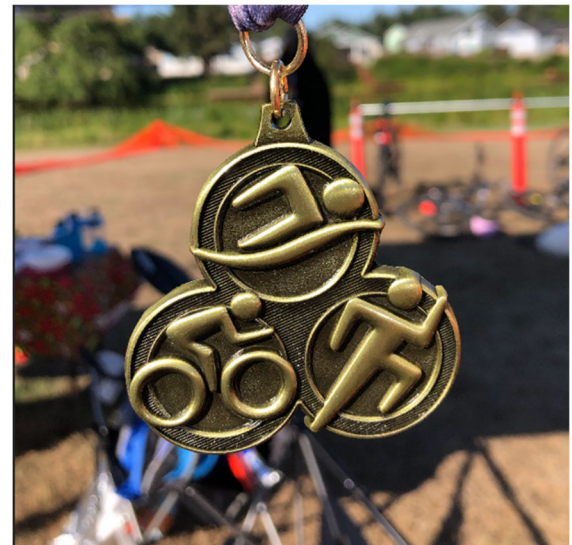
USAT Finisher Medal Ocean Shores Triathlon