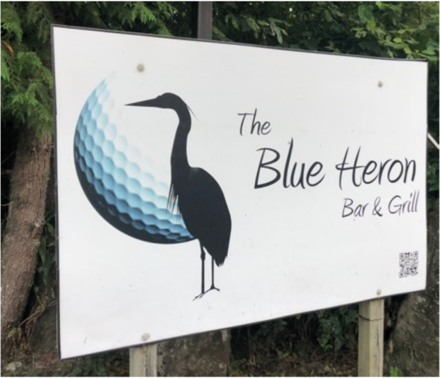
Blue Heron 15k Results, Carnation Marsh, August 21, 2022