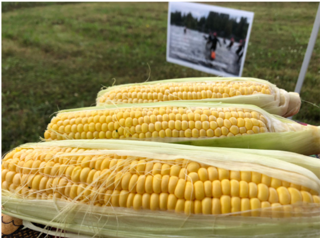
All finishers were treated to hot buttered corn on the cob at the Blue Heron 15k